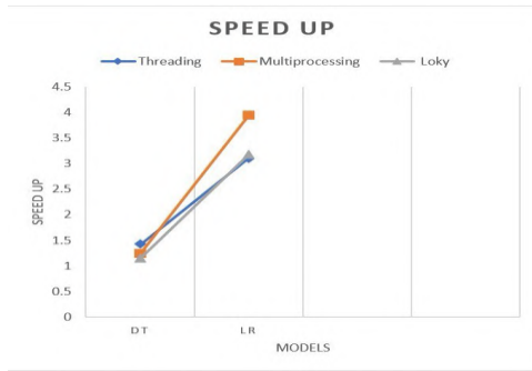
Fig.3 Compare the two models' speed up